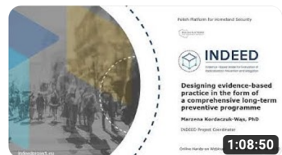
INDEED's project webinar 'Designing Evidence based practice', 4th July...