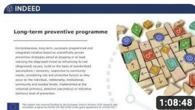
INDEED Webinar | Evaluating Evidence-based preventive...